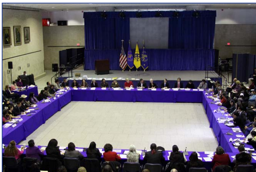
Department of Health and Human Services 12th Annual National Tribal Budget Consultation Session in Washington, DC