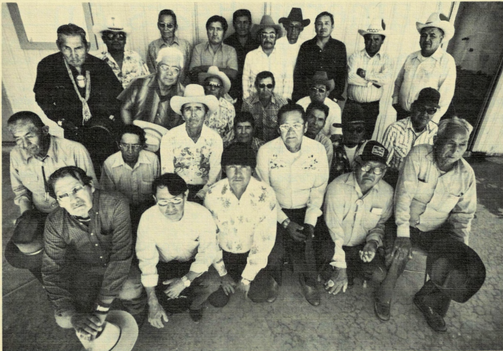
INDIAN WORKERS, such as these Navajo miners, employed in the mining and processing of uranium in the 1950's and 1960's are now experiencing unusually high rates of cancer and chronic lung disease. To seek compensation for these damages, a lawsuit has been filed on behalf of the miners and their families and is expected to go to trial early next year.