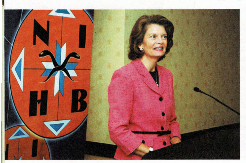
U.S. Senator Lisa Murkowski (R-AK)

As a result of a new direction being set by the NIHB Board during its 2007 strategic planning retreat, NIHB held its first Annual Appropriations Summit in Washington DC, on March 6, 2008. The Summit was attended by Tribal leaders and personnel from the Indian Health Service (IHS), Department of Health and Human Service (DHHS) and National Council of Urban Indian Health (NCUIH).