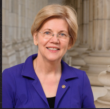
Elizabeth Warren Senator (D-MA)