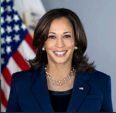
Kamala Harris Former Vice President of the United States