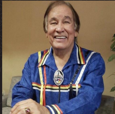
Billy Mills (Oglala Sioux) Olympic Gold Medalist