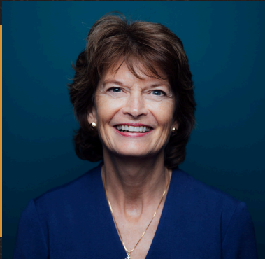
Lisa Murkowski Senator (R-AK)