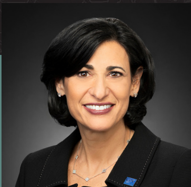
Dr. Rochelle Walensky Former CDC Director